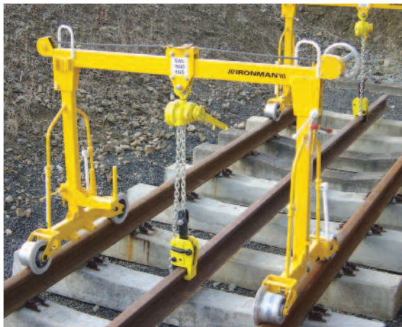
Typical application shot showing a CR1000 in use with a Yale D85 Pul-lift and an 'Iron man'.