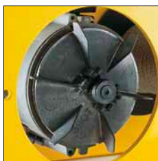
Spring pressure disc brake