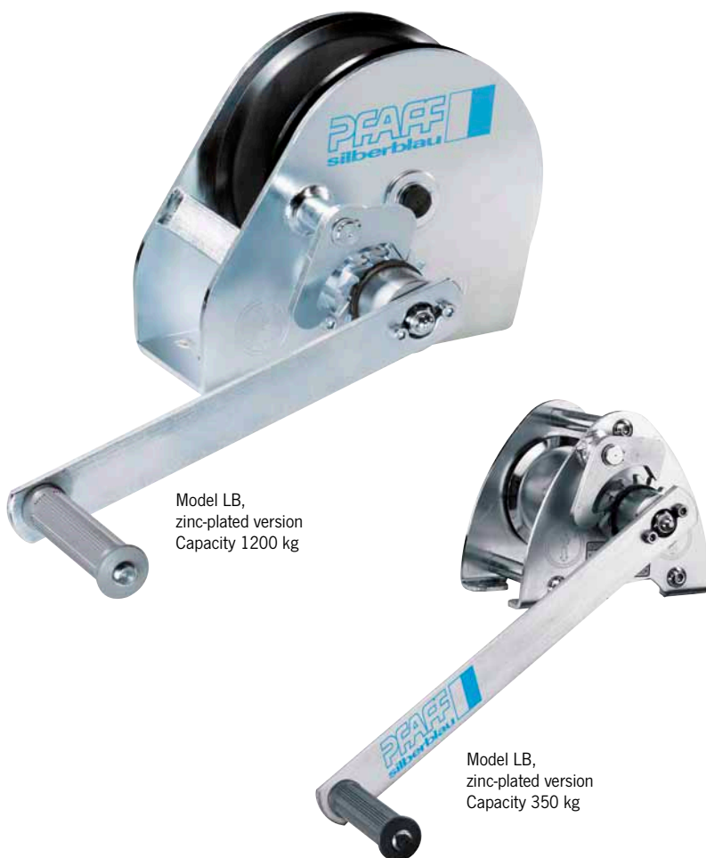
Model LB, zinc-plated version Capacity 1200 kg