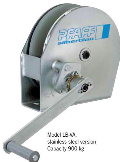
Model LB-VA, stainless steel version Capacity 900 kg