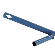
Option: Foldable crank with tiltable handle for use in confined spaces.