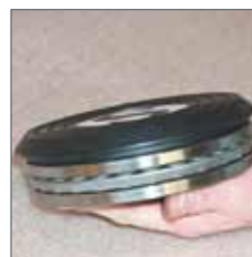
Ball bearing for turning plate