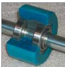
Rollers with ball bearing