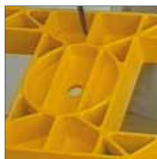
Chassis from ductile graphite iron